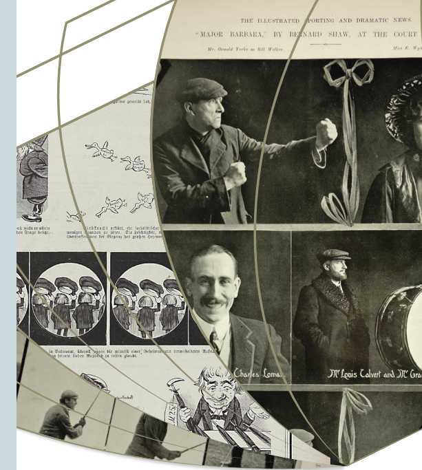
IMAGE SEQUENCING IN PERIODICALS

www.rub.de/journalliteratur www.facebook.com/FORJournalliteratur www.twitter.com/journal_lit | @Journal_Lit